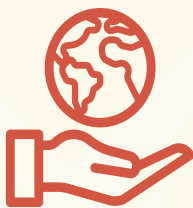
Environmental, Social, and Governance (ESG) or sustainability

Increasingly, in-house pro bono programs are strategically aligning their efforts with other corporate initiatives and goals, including: